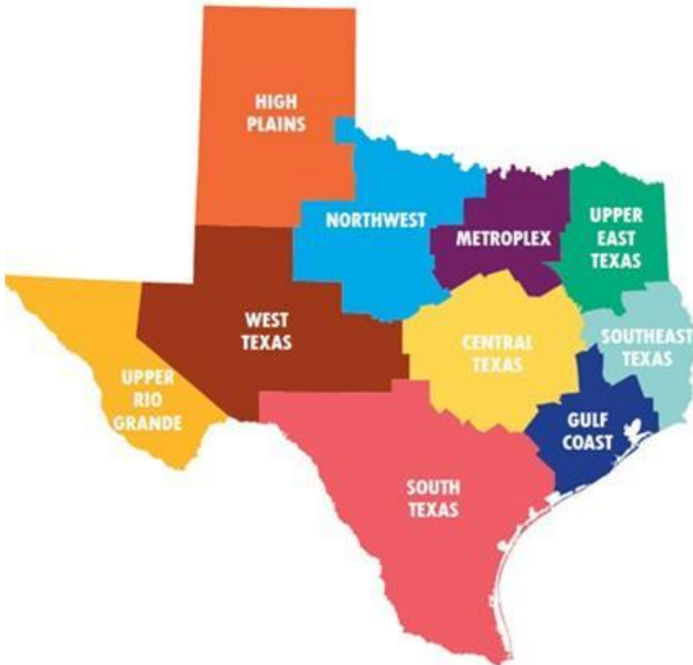
Figure 1. Texas Higher Education Coordinating Board's 10 regions.

Economics affect enrollment as well. Two-year college enrollment has usually expanded in times of increasing unemployment, in part because students want to update their skills to prepare for better jobs or jobs in different fields. During the Great Recession, enrollments surged at two-year colleges, as seen from 2008 to 2010. The pattern of decreased enrollments at two-year schools from 2011 to 2014 were similar to what has happened many times before; when the economy improves, many students, especially at the two-year level, bypass higher education for the workforce.